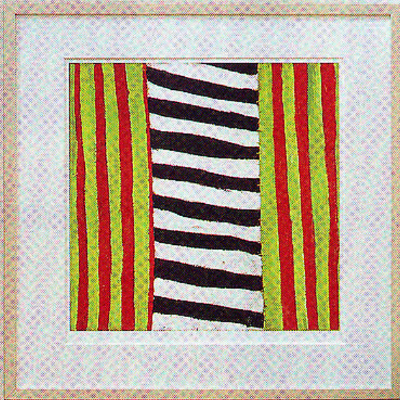
Do Not Go

32" x 32" when framed. Limited edition giclee of 200, plus proofs. Signed and numbered by the artist. Black and Pine frames suggested. Unframed: 330030 $410 Framed Classic: 330031 $550 Framed Decorative: 330032 $600