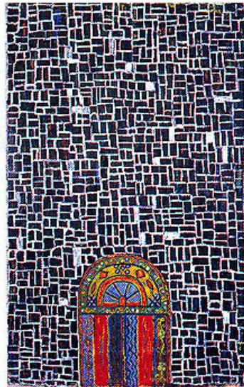
Black and White Stones in Old Sanaa

24" x 24" when framed. Limited edition giclee of 200, plus proofs. Signed and numbered by the artist. Black and Mahogany frames suggested. Unframed: 330040 $320 Framed Classic: 330041 $425 Framed Decorative: 330042 $475