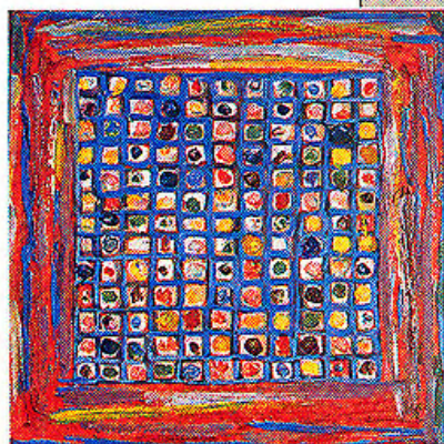
One Hundred Forty Three Windows

32" x 32" when framed. Limited edition giclee of 200, plus proofs. Signed and numbered by the artist. Black and Pine frames suggested. Unframed: 330030 $410 Framed Classic: 330031 $550 Framed Decorative: 330032 $600