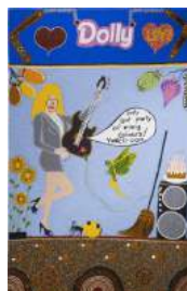
Kaylene Whiskey: Seven Sisters, 2019, Photo: Vincent Girier-Dufournier