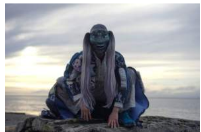
Zadie Xa, "Child of Magohalmi and the Echoes of Creation", 2019