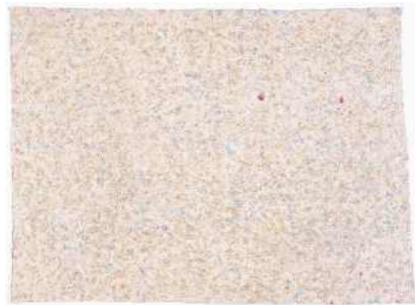
Howardena Pindell Untitled #21 1978