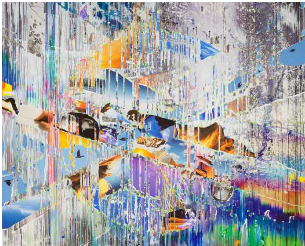
Sarah Sze (b. 1969), Crisscross , 2021. Oil, acrylic, acrylic polymer, and ink on composite aluminum panel, with wood support, 114 x 142 1/2 in. (289.6 x 362 cm). Shah Garg Collection. © Sarah Sze, courtesy of the artist and Victoria Miro.

Making Their Mark brings together more than fifty artworks from the Shah Garg Collection, which is committed to amplifying the voices and visions of women artists. The exhibition is the first public presentation of this important collection, premiering in New York in 2023. Making Their Mark juxtaposes contemporary practices with pathbreaking historical works to illuminate transgenerational affinities, influences, and methodologies among artists from the postwar era to the present. Featuring a wide spectrum of artworks spanning almost eight decades, the exhibition emphasizes dialogues between artists who circumvent and break through conventions in art-making, embracing craft techniques, uncommon supports, and alternative materials. Accompanied by a major publication produced in advance of the exhibition, Making Their Mark assembles significant examples by artists whose works go beyond prescribed definitions of art-making established within a historically patriarchal field.