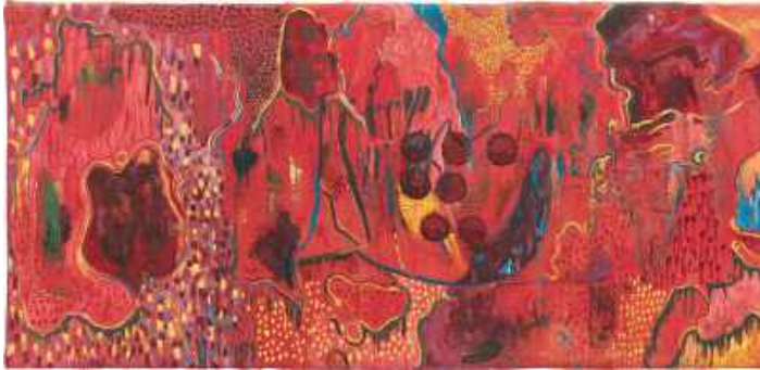
Pacita Abad Liquid Experience 1985