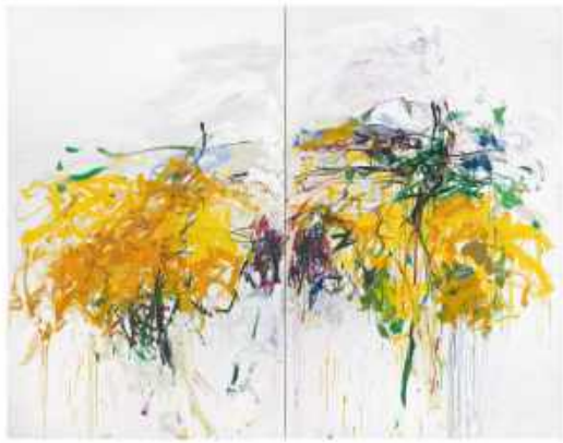
Joan Mitchell Untitled