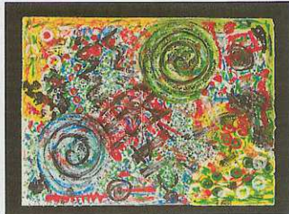
Close to you 7-colour lithograph, silkscreen, collage on hand made hand-coloured paper Mono print 81.3 x 106.7 cm (32 x 42 in.)