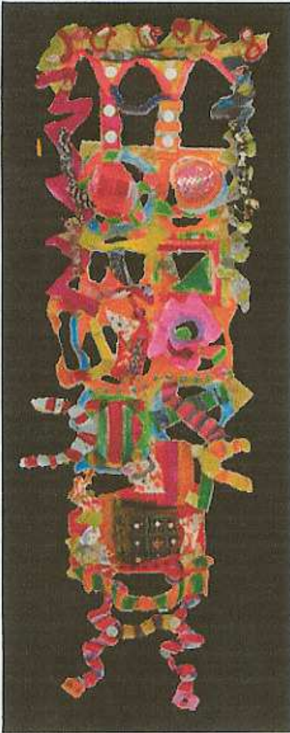
Cross dressing 23-colour mixed media, hand-coloured paper pulp collage, relief sculpture 146.1 x 50.8 x 7.6 cm (57½ x 20 x 3 in.)