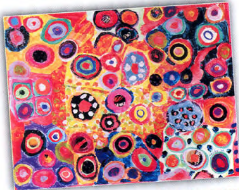
Sugar Donut - 2003

Born in Basco, Batanes, Pacita created more than 4,000 vibrant works of art that are now admired, enjoyed, loved and collected by museums, public institutions and private collectors in the United States, Asia, Europe, Africa and Latin America.