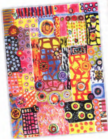
Feel the Beat! - 2003