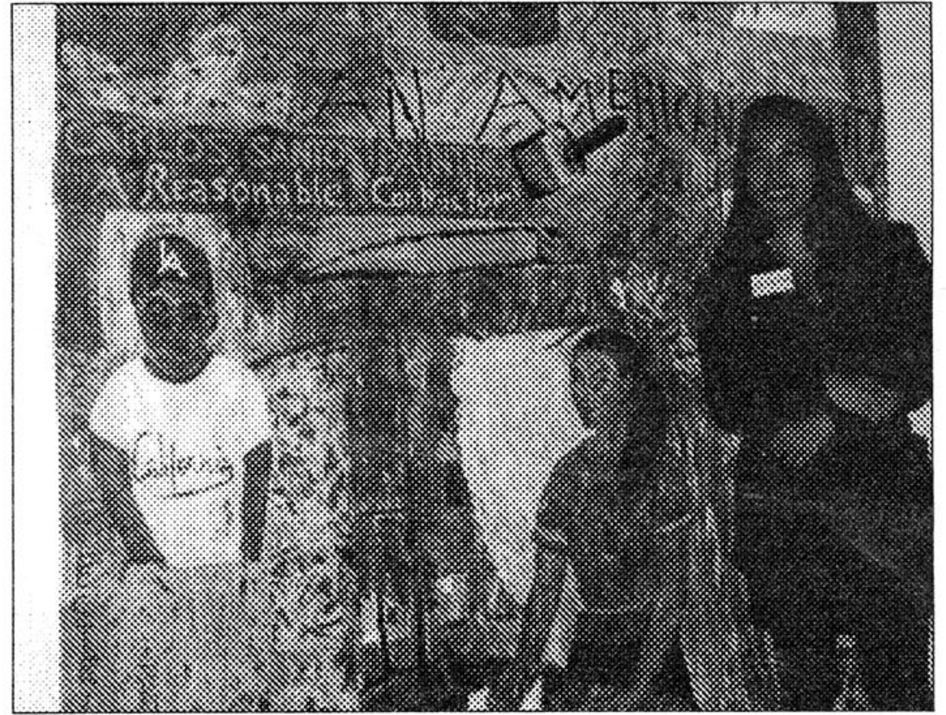
Multi-media artist Pacita Abad