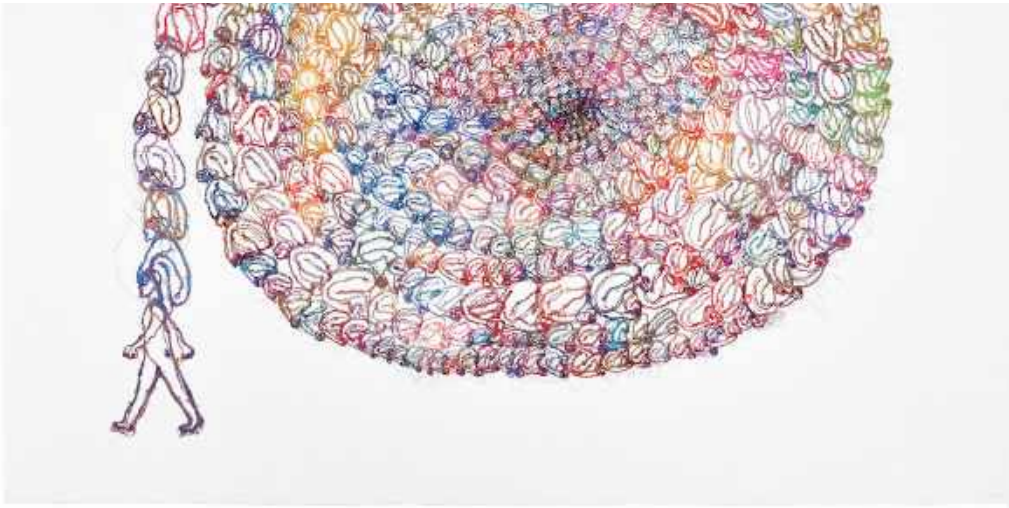
Do Ho Suh, 'Wise Man', 2019, thread embedded in STPI handmade cotton paper, 157.5 x 206 cm. Produced at STPI - Creative Workshop & Gallery, Singapore.