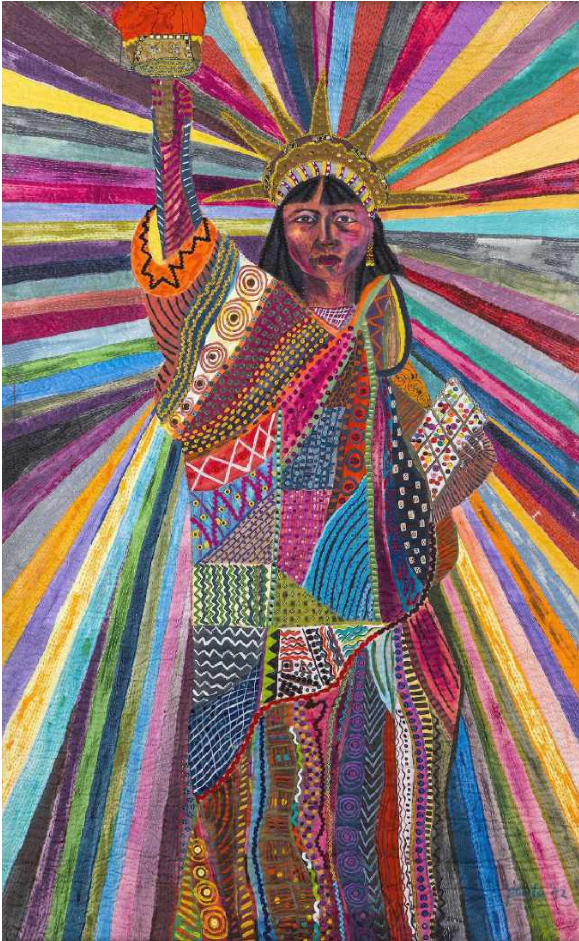
Pacita Abad, 'L.A. Liberty', 1992, acrylic, cotton yam, plastic buttons, mirrors, old thread, painted cloth on stitched and padded canvas. 239 x 147cm.