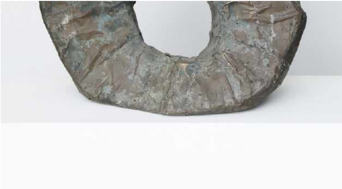
Sofu Teshigahara, '(Title unknown)', 1963 Wood, brass. 86 x 74 x 44cm.

Fairgoers can look forward to a range of galleries from around wider Asia as well. Tokyo-based Taka Ishii Gallery will bring two artists, Japanese artist Sofu Teshigahara and Portuguese Leonor Antunes, together to create a conversation between their oeuvre of work. The selection of artists for Frieze aptly captures the gallery's goal of exposing international contemporary artists into Japanese society as well as to create a platform for domestic artists on an international level. Visitors can expect prices of USD10,000 to USD70,000.