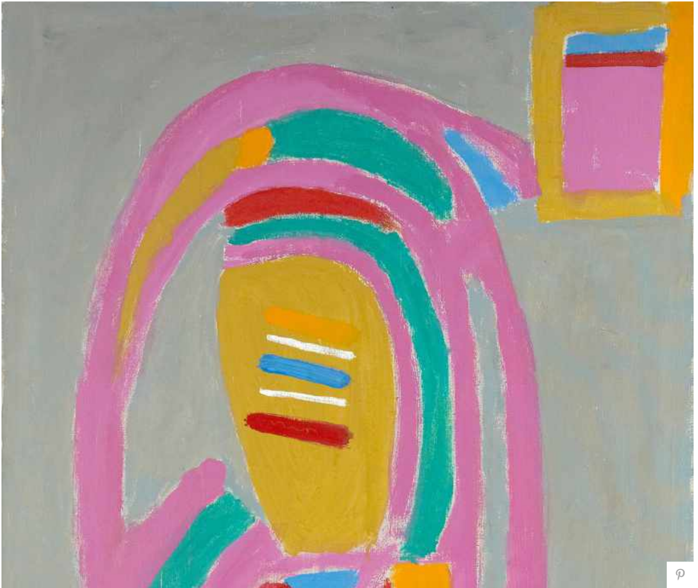
BETTY PARSONS, THE QUEEN OF THE CIRCUS, 1976.

Alison Jacques will showcase the work of the gallerist and dealer Betty Parsons, who made a seminal contribution to the post-war New York art scene. Her eponymous gallery, which opened in 1946, promoted the work of emerging artists of the era, including Helen Frankenthaler, Hedda Sterne, Mark Rothko and Jackson Pollock. Now, an exhibition at Alison Jacques in central London uncovers Parsons' lesser-known role as an abstract painter and sculptor, charting the evolution of her signature bold, colourful style throughout her six-decade career. Highlights of the show, which focuses on her paintings from the 1960s and 1970s, include Midnight Flute (1968), with its crimson and cerulean concentric ovals, and the carnivalesque The Queen of the Circus (1973), pictured here.