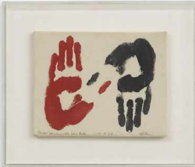
SUSAN HILLER SMALL PAINTING WITH LONG TITLE, 1969, COURTESY OF LISSON GALLERY.

Lisson Gallery will celebrate the late artist Susan Hiller with a solo booth showcasing pieces from her remarkable career spanning almost half a century. Exploring themes of family and traditional gender roles, the pieces will include one of the artist's earliest works, Small painting with long title (1969), which will be shown for the first time.