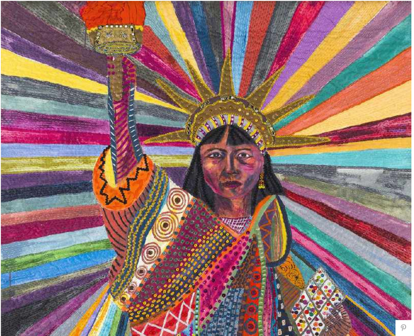
PACITA ABAD, L.A. LIBERTY, 1992.