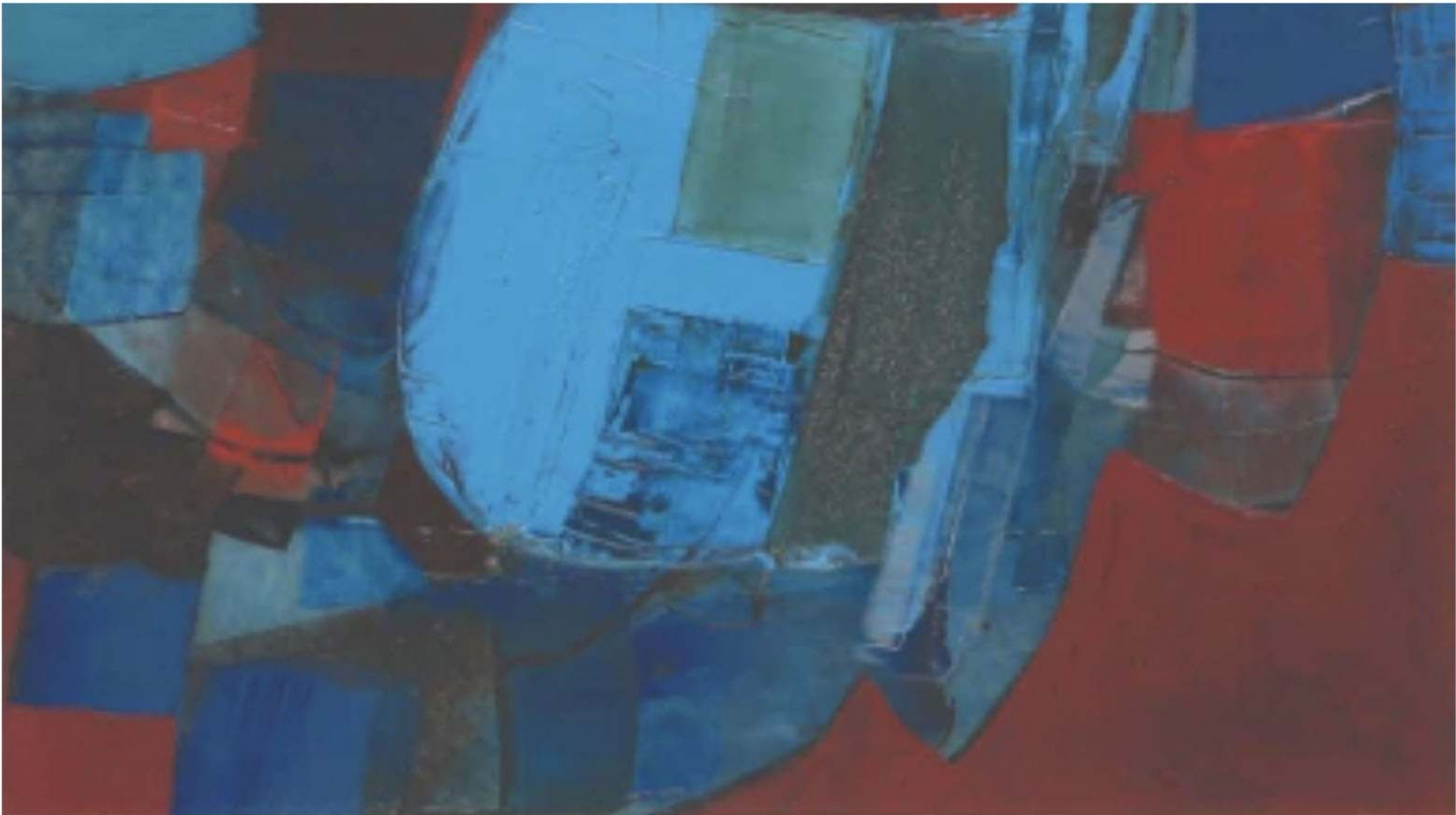
"Mandaue" by Jose Joya (1931 – 1995). Signed and dated 1981 (verso), oil on board, 22" x 14" (56 cm x 36 cm)

A revealing early work — from the collection of the novelist F. Sionil Jose, who is also a National Artist for Literature — throws light on the art of Lao Lianben. Painted in 1975 it has the cryptic title “No. 33” and is a powerful piece in inky black.