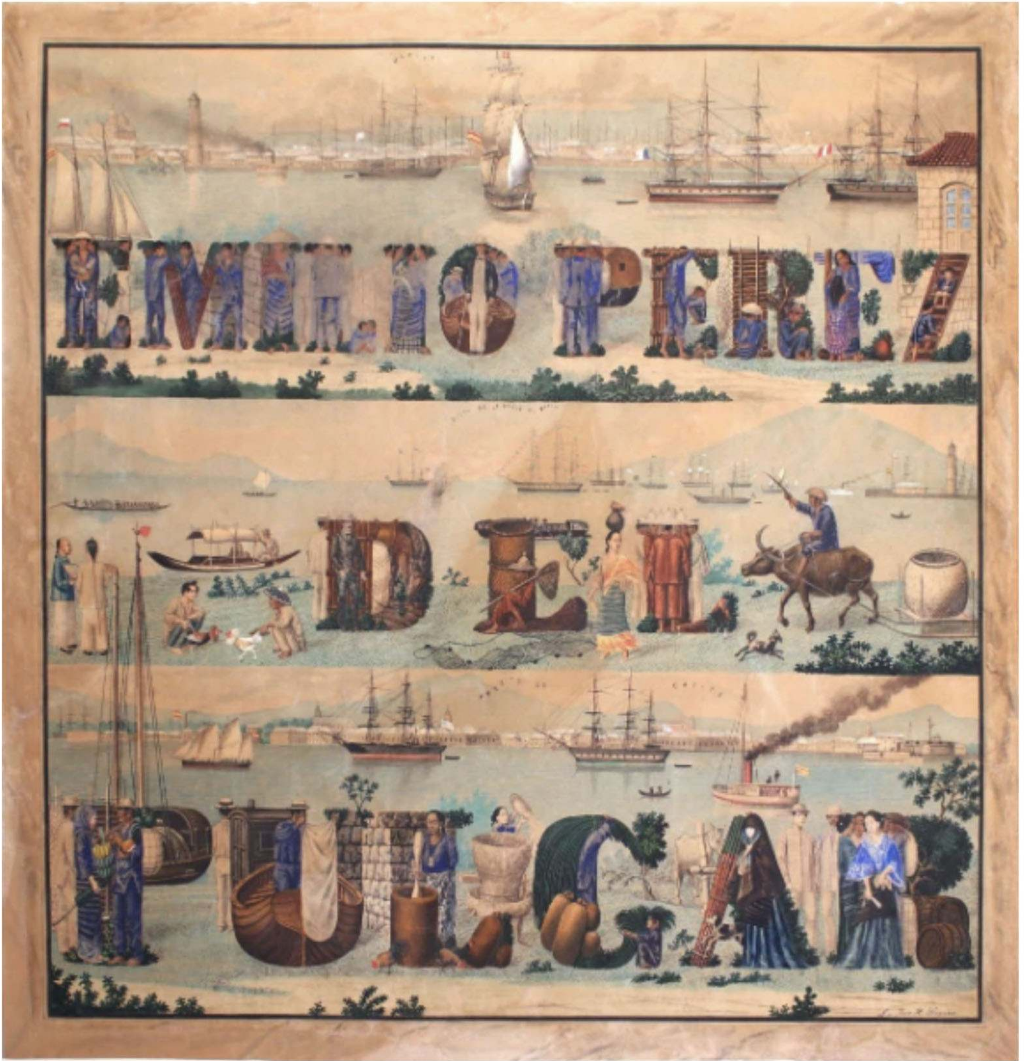
"Emilio Perez del Pulgar" by José Honorato Lozano (1821 – 1885). Circa 1840, watercolor on paper, 26 1/4" x 27 1/4" (67 cm x 69 cm)

A recently discovered 'letras y figuras', created and signed by the master of this art, Jose Honorato Lozano is a rendition of the name 'Emilio Peres del Pulgar.' Judging from the beehive of activities depicted in this watercolor, it can be deduced that del Pulgar was a trader of some means, involved in the buy-and-sell of all kinds of provisions across our islands.