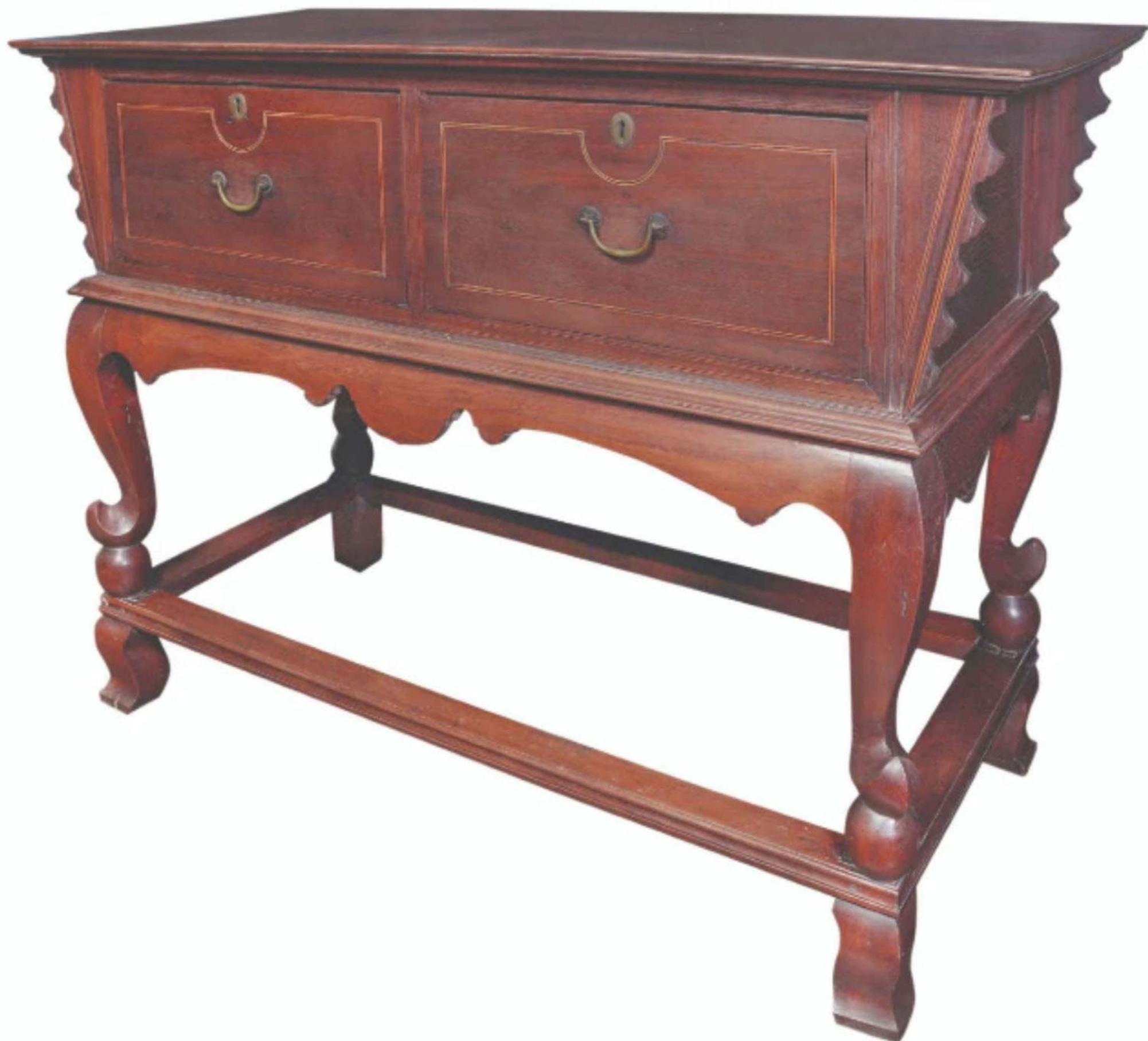
The "Batangas Dos" Mesa Altar. First half of the 19th century (1800 – 1850), Balayong, Batangas province. 37 1/2" x 24" x 53" (95 cm x 61 cm x 135 cm). Property from the collection of a distinguished family

Other exquisite masterpieces by Jerry Elizalde Navarro, Fabian de la Rosa and Cesar Legaspi are other highlights of this auction.