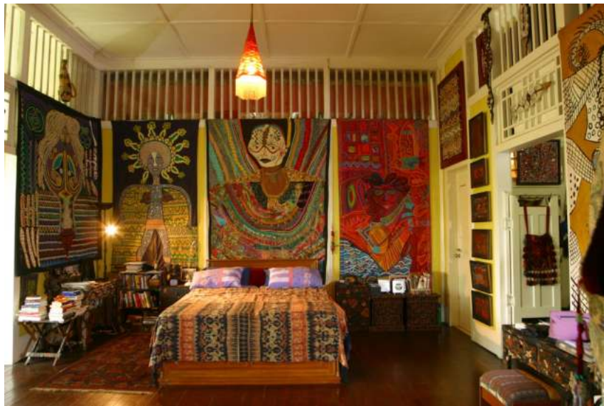
Pacita Abad's home in Singapore

The show brings together exuberant signature works – from her colourful trapunto embroideries to major paintings, with a focus on four main bodies of work including Masks and Spirits series (1979 – 1991), the Immigrant Experience (1983-1995), the Door to life series (1998-2003) and abstract works (1985-2002) – that together span abstraction to social realism. The exhibition takes visitors on a journey from Manila to Hong Kong, via New York, Sanaa and beyond, the locations that she worked in across her career.