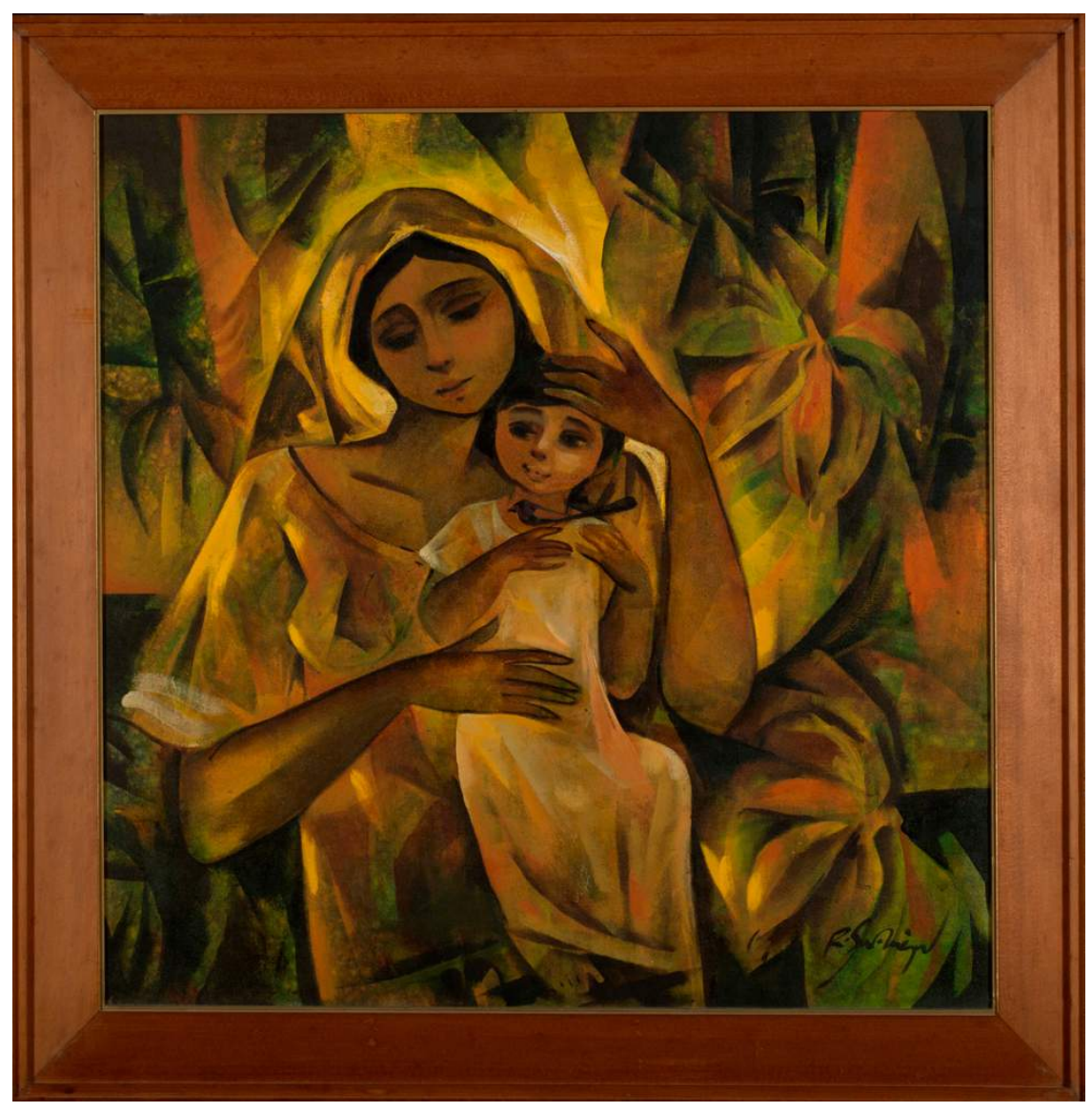
Mother and Child Roger San Miguel

Art educators will converse on how the image of the woman is portrayed by artists across different periods in Philippine art history and in different mediums. Using the works featured in the exhibition, guests will discuss common themes and depictions in relation to gender representation in art. The forum will happen on May 20, 3pm.