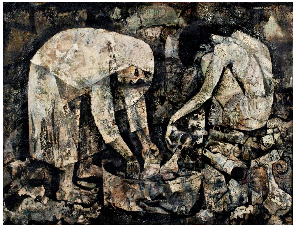
Bottle Gatherers Vicente Manansala

The exhibit runs until June 24, 2023, at the Yuchengco Museum located at the RCBC Plaza, corner Ayala Avenue and Senator Gil J. Puyat Avenue in Makati City. Visiting schedule is Monday to Sunday, from 10am to 6pm.