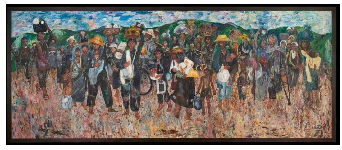
Pacita Abad, 'Flight to Freedom,' 1980; collection of National Gallery Singapore.

While most of the attention in "Pacita Abad" will understandably go to her eyepopping trapunto paintings, the handful of paintings on canvas presented in the show demonstrate her as a master there as well.