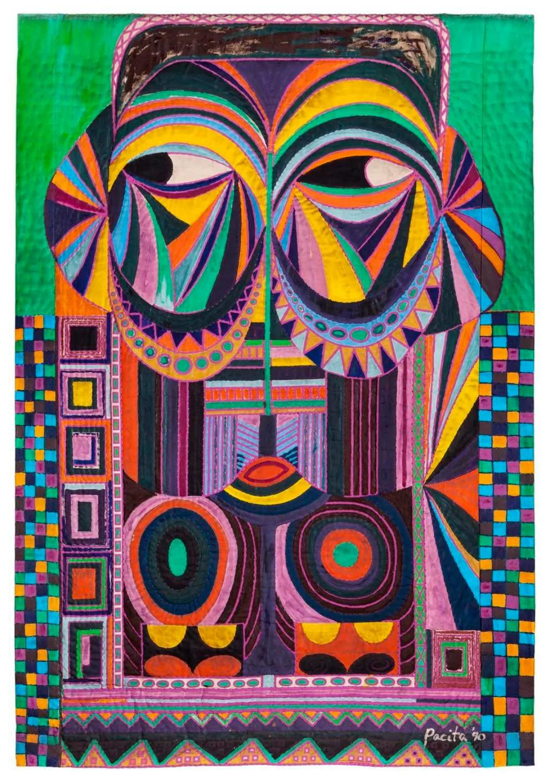
Pacita Abad, 'European Mask,' 1990; collection Tate Modern, purchased with funds provided by the Asia Pacific Acquisitions Committee 2019.

These lessons found their greatest expression in her trapunto paintings: canvases that she painted, stuffed and richly embellished with buttons, cowrie shells, beads and mirrors. She created hundreds of these magnificently textured works, occasionally enlisting the help of family members and assistants, thereby evoking the communal making that inspired her.