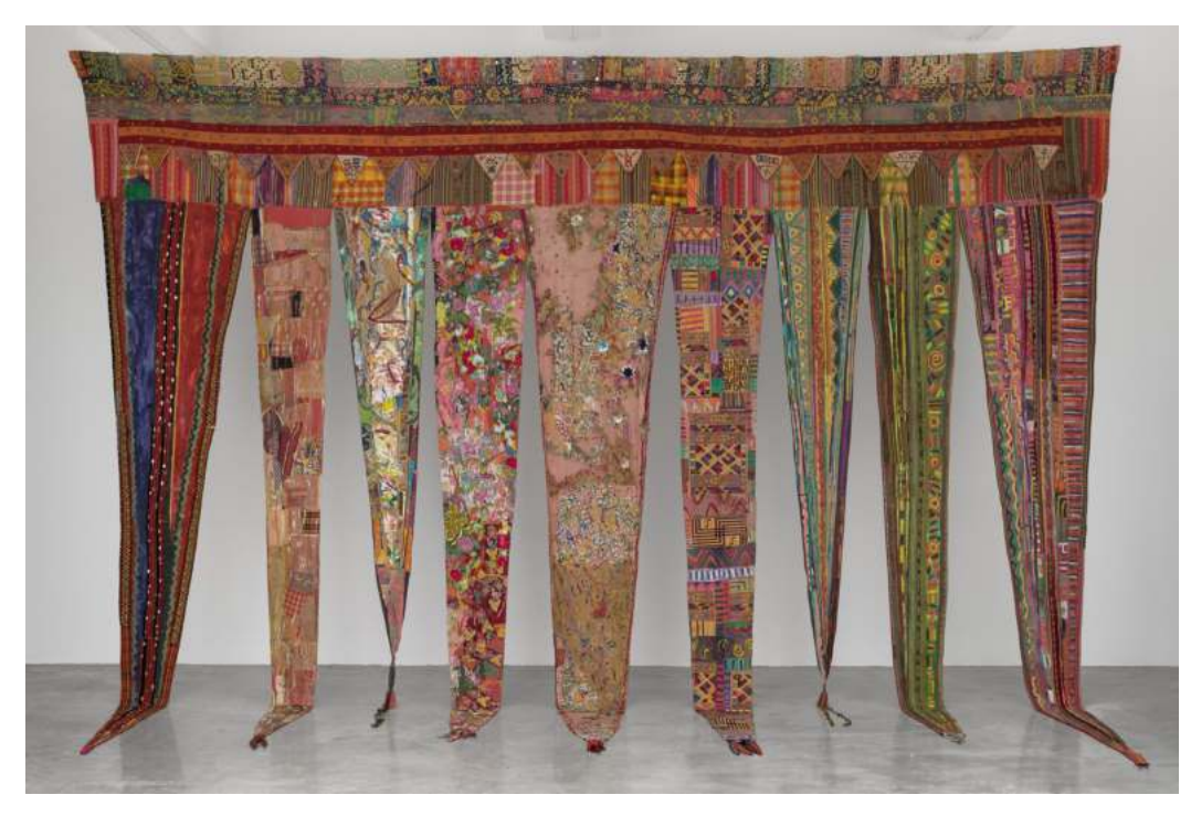
PACITA ABAD , 100 years of freedom: Batanes to Jolo , 1998, oil and acrylic; abaca, pineapple, jusi and banana fibers; Baguio ikat ; Batanes cotton crochet; Ilocano cotton; Chinese silk and beads; Spanish silk; Ilongo cloth; Mindanao beads; and Zamboanga and Yakan handwoven cloth and sequins stitched on dyed cotton, 564 × 500 cm.