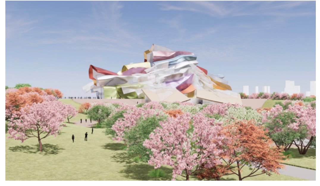
Conceptual rendering of Quanzhou Museum of Contemporary Art by FRANK GEHRY , 2023.