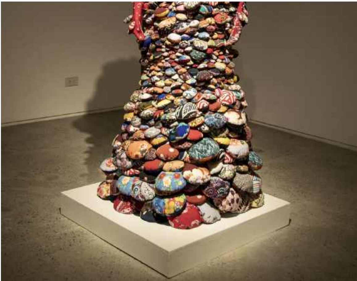
Installation by Tekla Tamoria.