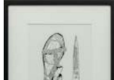
Pio Abad. Untitled (Inventory XLIII) , 2016, ink on paper.

Pacita Abad. Wild thing I think I like it , 2003, 30-colour, stencilled coloured paper pulp, lithograph, silkscreen, collagraph, collaged embellishments on handmade cream STPI (monoprint).