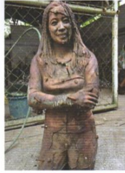
Clay model of Julie Luch's Pacita Abad , 2014, bronze, height 6' 2".

A decade ago, Filipina painter Pacita Abad (1946, The Philippines – 2004, Singapore) passed