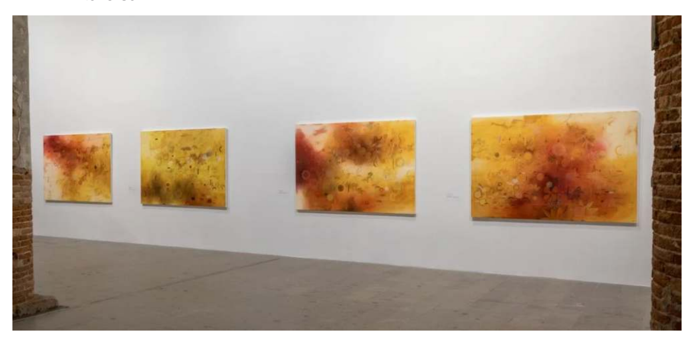
Works by Emmi Whitehorse in the "Foreigners Everywhere" main exhibition at the 60th Venice Biennale.