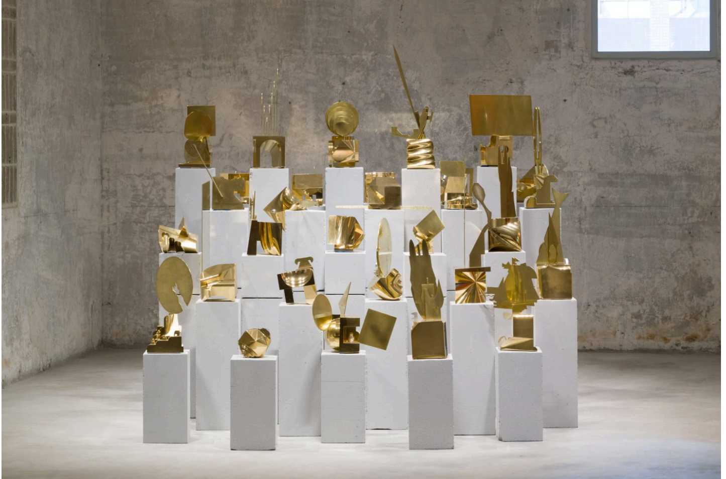
Installation view of Christopher K. Ho's sculpture series 'Return to Order' at his solo show 'I Am a 70-Year-Old British Sculptor' in PHD Group, Hong Kong, 2024.