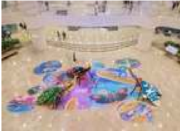
Pacific Place hosts 'Lanternfly Ballet' by Monster Chetwynd