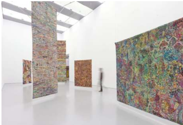
This edition showcases the work of Pacita Abad, the late Filipino-born American Ivatan visual artist, presented by Tina Kim Gallery (New York) and Silverlens (Manila, New York)

With world-class bars and restaurants, incredible shopping and beautiful hiking trails, you'll find fun in just about every corner of Hong Kong. And one week of the year, it goes into overdrive: at the end of March when Art Basel Hong Kong rolls around.