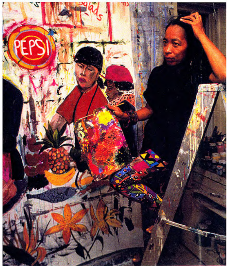
KOREAN GROCER (ABOVE); LA INDEPENDENCE (BELOW)