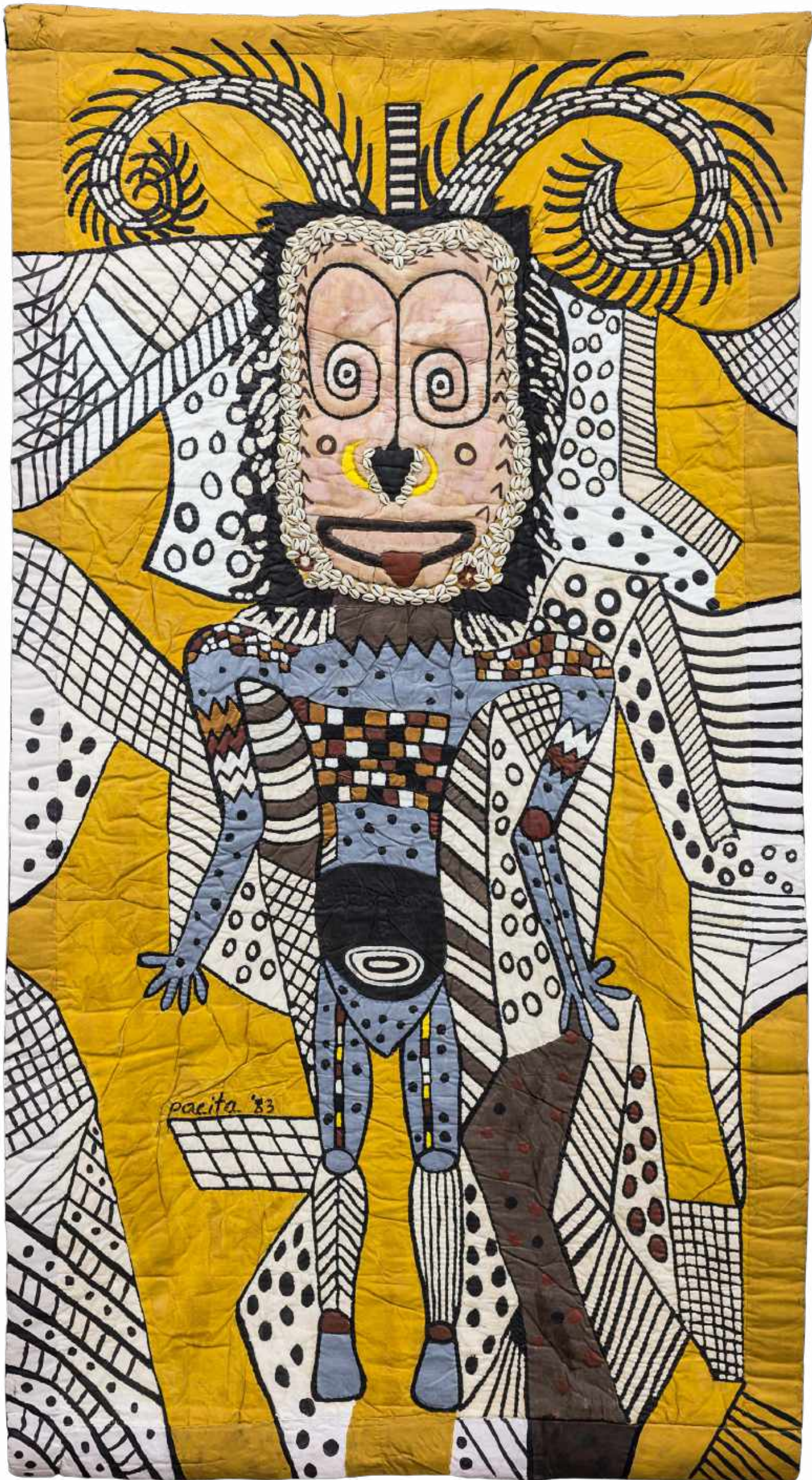
Hagen Man , 1983 acrylic paint, cowrie shells stitched on padded canvas 97.64h x 51.97w in • 248h x 132w cm